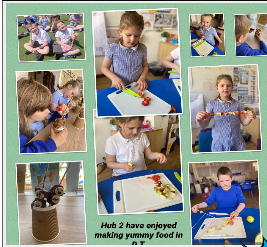
Hub 2 have enjoyed making yummy food in DT

Hub 2 have enjoyed learning all about different utensils used to prepare food and trying a few out. We have made fruit kebabs and chocolate penguins!